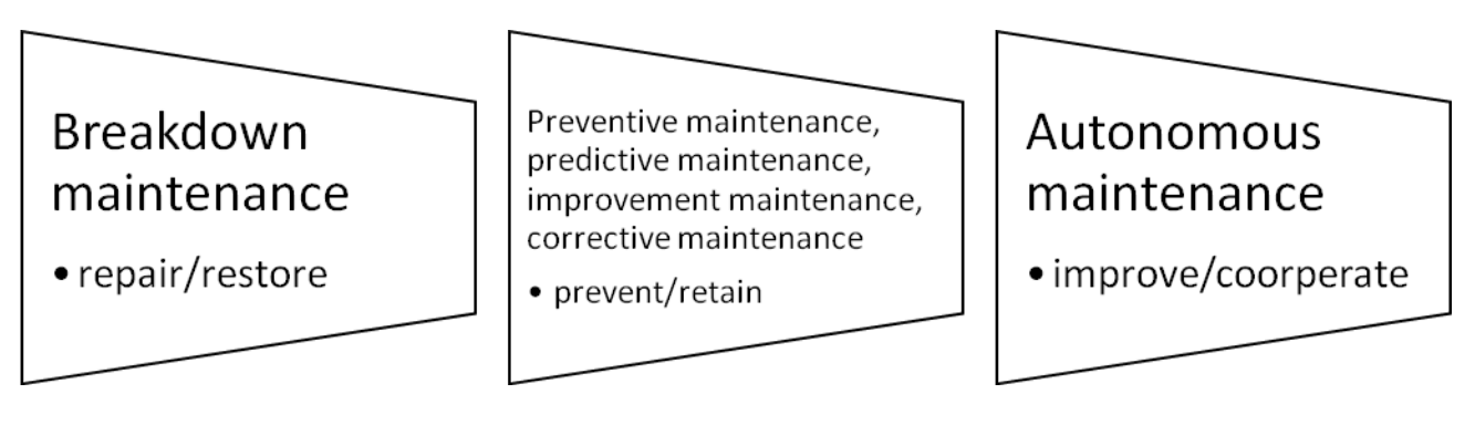
Figure 2. Maintenance policy

Maintenance perspective has changed from being considered a barrier to change into activities that are necessary. Maintenance activities not only under the responsibility of the maintenance department but a shared responsibility (Ding & Kamaruddin, 2015). Maintenance is the responsibility of all levels of management. Maintenance is more focused on maintenance independent, autonomous maintenance (AM). So, all levels of management need to improve skills in the field of maintenance. This change of perspective can be viewed simply in Figure 2 below: