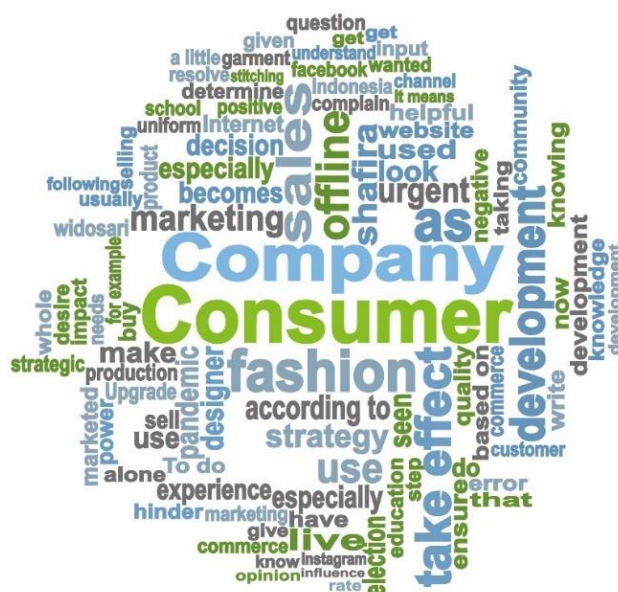
Figure 3. Word cloud information from expert judgment or designers.