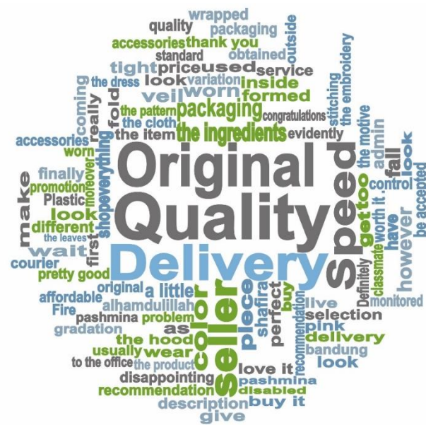
Figure 2. Word cloud information from OPRs.

Figure 2 features a word cloud containing the words most frequently used by the reviewers. In this study, reviews unrelated to product development design were ignored, such as those related to delivery and speed, which are not fashion product development parameters. Of those reviews related to fashion product development, the words that most often appeared were product, good, quality, original, material, comfortable, color, soft, cut, neat, smooth, cool, hijab, pattern, thin, variety, and shape. Meanwhile, the colors often used in the OPRs were toska, pink, blue, dusty, brown, dark, green, navy, yellow, and turmeric. The detailed criteria for stitching quality that appeared in the OPRs were cuts, neatness, defects, threads, stitches, folds, embroidery, and buttons.